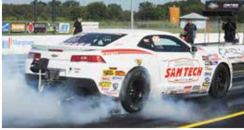
2012 COPO 8.90@150.16 MPH NHRA National Record Holder FS/X