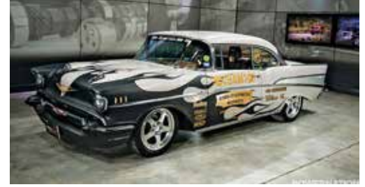
1957 Bel Air Built by SAM Tech students in 56 days Featured in Hot Rod Magazine & PowerNation TV