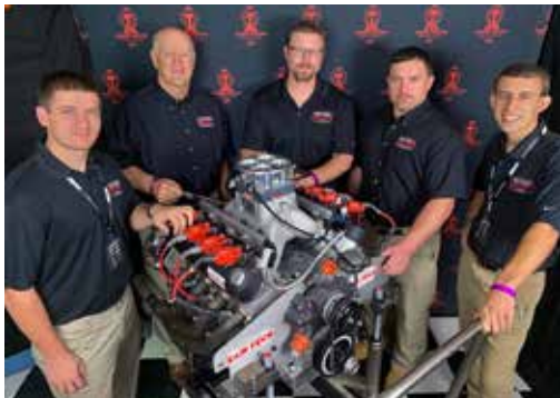
Engine Masters Challenge Extreme LS Champion • 801@7100 HP • 619@5900 TQ

The 2019 Engine Masters Challenge saw SAM Tech return to their championship ways, winning the Extreme LS Class. This marks the fifth time SAM Tech has won an Engine Masters class. The student and instructor built engine is a 440 ci LSX Block with LS7 CID heads. This is an EFI combination, run on the Holley HP system. In addition to winning Extreme LS, SAM Tech took home the titles of Horsepower King and Torque Monster as the engine made the most horsepower and torque for both EMC classes. Congratulations to all the students and instructors, winning the Extreme LS class would not be possible without their months of dedication and hard work.