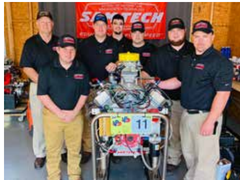
Race Engine Challenge 400 SB2 • Runner-Up • 790@7000 HP • 643@5900 TQ

The 2019 Engine Masters Challenge saw SAM Tech return to their championship ways, winning the Extreme LS Class. This marks the fifth time SAM Tech has won an Engine Masters class. The student and instructor built engine is a 440 ci LSX Block with LS7 CID heads. This is an EFI combination, run on the Holley HP system. In addition to winning Extreme LS, SAM Tech took home the titles of Horsepower King and Torque Monster as the engine made the most horsepower and torque for both EMC classes. Congratulations to all the students and instructors, winning the Extreme LS class would not be possible without their months of dedication and hard work.