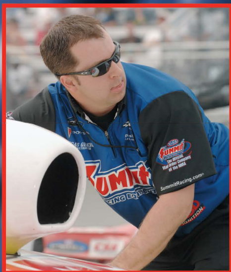
SAM Tech GRADUATE AT KB RACING

Ten-time Military Friendly School 2013-2022