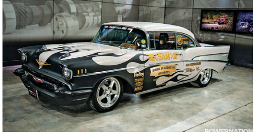
1957 Bel Air Built by SAM Tech students in 56 days Featured in Hot Rod Magazine & PowerNation TV